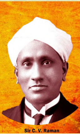
Sir C. V. Raman

Conference Website for further information: