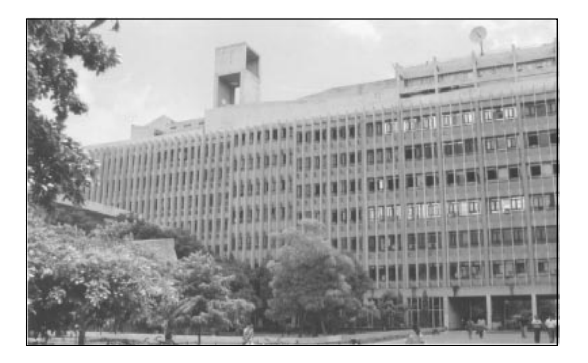
INDIAN INSTITUTE OF TECHNOLOGY, NEW DELHI

Indian Institute of Technology, Delhi is one of the seven institutes of technology created as centres of excellence for higher training, research and development in science, engineering and technology in India. The others are at Kanpur, Kharagpur, Madras, Bombay, Guwahati and Roorkee. Established as College of Engineering in 1961, the Institute was later declared an institution of national importance under the "Institutes of Technology (Amendment) Act, 1963" and was renamed "Indian Institute of Technology Delhi". It was then accorded the status of a deemed university with powers to decide its own academic policy, to conduct its own examinations, and to award its own degrees.