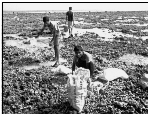
Figure 1. Coral and shingle collection in Kalpitti Island during low tide

Coral boulders are normally collected by the islanders for their own use, particularly for construction purposes. There is no class distinction for collecting coral boulders and people in all groups use to collect corals. Shingle collection is a regulated activity and the people who wishes to collect it must get the permission from the Lakshadweep Administration and the person has to pay Rs. 5 per bag. But the available records had shown that no one had followed this regulation since 1998. Further, sand collection also goes on the shore all around the island during fair season. The indiscriminate collection of coral boulder, shingle and sand from islands give maximum stress along the eastern shore and reef along the western side during low tides.