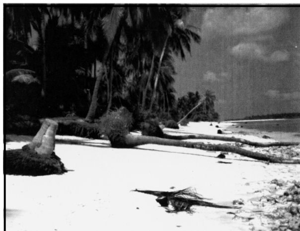
Figure 2. Effect of soil erosion in Thinkara Island

The soil compatibility of islands is decreasing as a result many shore line coconut trees are falling down. In under water, many borers and foulers attack both living and dead corals. The major groups that cause erosion to coral skeleton encompass are algae, sponges, polychaetes, sipunculids, bivalves and echinoderms.